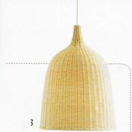
1 When asked to name a handful of current design favourites, Judy's list (above right) runs the gamut from architecture to sculpture to a lampshade. Tord Boontje, Bodo Sperlein, Ikea ... the list is as broad-ranging as it is insightful.