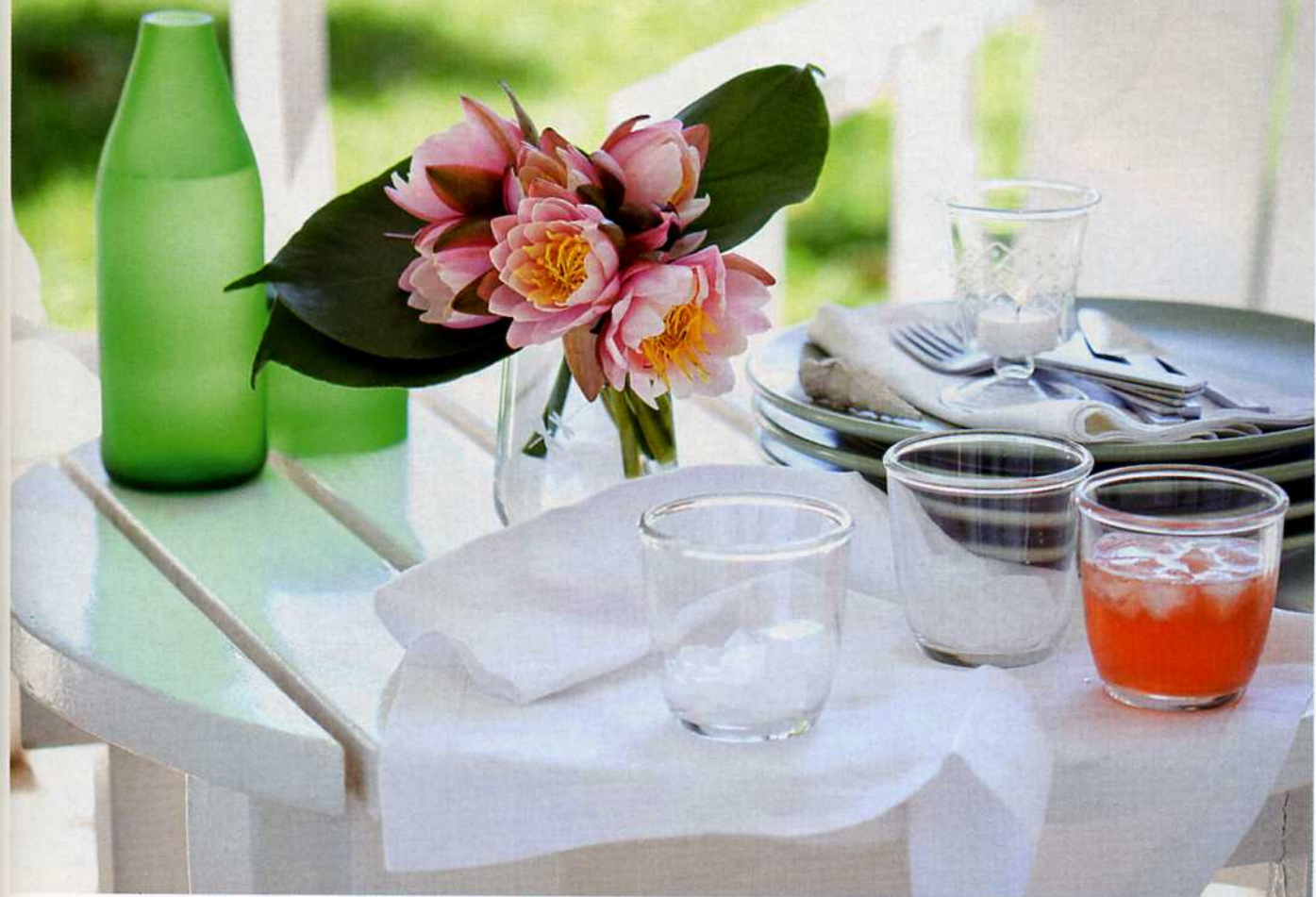
Chair and table, stylist's own; seek similar painted Adirondack chair and table, from $1510/3-piece set, Ocean Country Furniture. Artecnic Tord Boontje polished 'TranSglass' lidded carafe in Green, $85, De De Ce Plus. Kate Spade 'June Meadow' tumbler (holding flowers), $79, Royal Doulton. Bird linen serviettes in White, $18.50 each, Avenue Joffre. Corona tumblers, $24.95/set of 6, Bodum. Barcelona stainless-steel cutlery, $139/24-piece set, Bodum. Shell, $8.99/tub, Spotlight. Hand-blown glass realight holder, $24, Shades of Pale. Dinner plates in Celery, $40 each, Bison Australia. Stockists, page 182